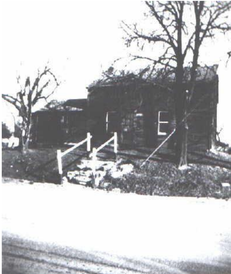
Dawson home on Rymal Road west of Upper James