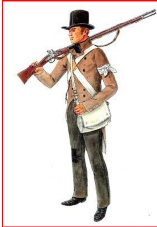
Uniform of Private in 5 th Lincoln Militia (Hemmings, 2012)