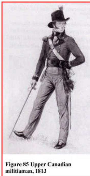
Uniform of a Captain in the Upper Canadian Militia

Captain of a Battalion Company of the 5 th Lincoln Militia throughout the War.